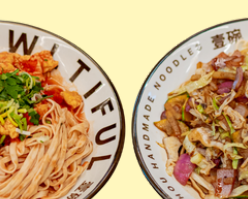
西红柿鸡蛋拌面 Dry Noodle with Stir-fried Tomato and Egg $15.80