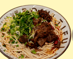
红烧牛腩拌面 Dry Noodle with Braised Beef Brisket $18.80