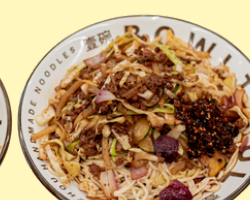
兰州干拌面 Dry Noodle with Stir-fried Mixed Vegetables $19.80