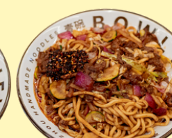
特色炒面 Special Stir-fried Noodle $19.80