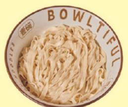
Jiū Yè 韭葉 Semi-Wide 面粗5.0mm 5.0mm Wide