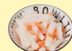
酸辣萝卜 Spicy & Sour Pickled Radish $4.8