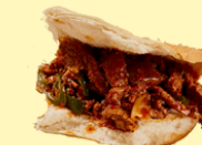
孜然羊肉夹馍 Lanzhou Style Spicy Lamb Burger $8.8