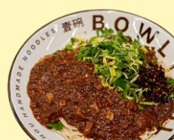
兰州炸酱面 Noodle with Soybean Paste & Minced Beef $16.80