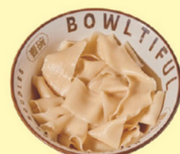
Dà Kuān 大寬 Super-Wide 面粗30mm 30mm Wide