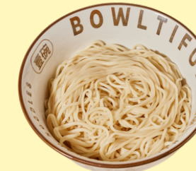
净面 Plain Noodle $5.0