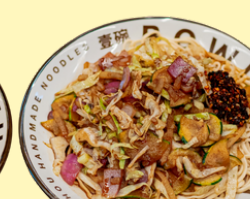
素干拌面 Dry Noodle with Stir-fried Mixed Vegetables $17.80