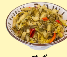
酸菜 Pickles $5.8