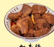
加牛腩 Braised Beef Brisket $8.8