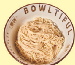
Xī De 細的 Thin 面粗1.0mm 1.0mm Round