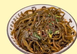
凉拌海带丝 Seaweed Salad $4.8