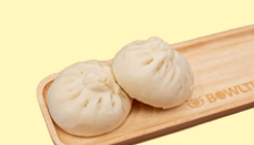
羊肉胡萝卜包子 2 of Lamb & Carrot Buns (limited supply / 限量供应) $8.8