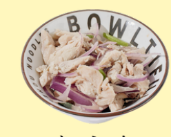
椒麻鸡 Spicy Chicken Salad 120g $8.8