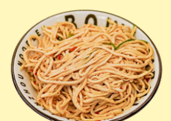
炆拌云丝 Shredded Tofu Salad $4.8