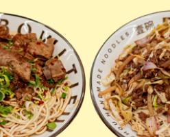
黄焖羊肉拌面 Dry Noodle with Stir-fried Vegetables & Beef Mince $18.80