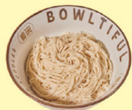
Máo Xī 毛細 Super Thin 面粗0.5mm 0.5mm Round