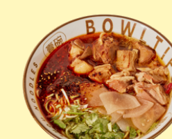
黄焖羊肉汤面 Braised Lamb Flap Noodle Soup $18.80