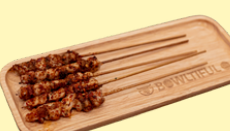
烤鸡肉串 Chicken Skewers (5串/15串一传) $11.8