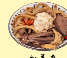
加羊杂 Braised Lamb Offal $8.8