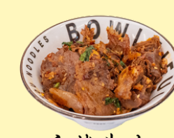
凉拌牛肉 Spicy Beef Salad 100g $8.8