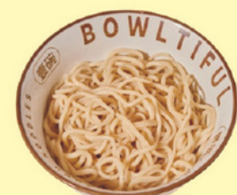
Èr Xī 二細 Thicker 面粗3.0mm 3.0mm Round