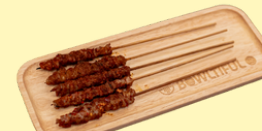
烤羊肉串 Signature Lamb Skewers (5串/15串一传) $11.8