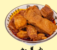
加羊肉 Braised Lamb Flap $8.8