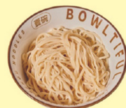
Sān Léng Zi 三棱子 Prism 面粗2.5mm 2.5mm Round