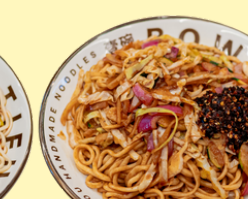
素炒面 Vegetarian Special Stir-fried Noodle $17.80