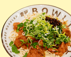
特色鸡丁拌面 Special Dry Noodles with Diced Chicken $18.80