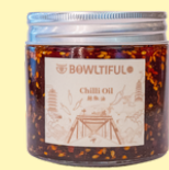
壹碗辣椒油 Homemade Chilli Oil 200ml $7.8