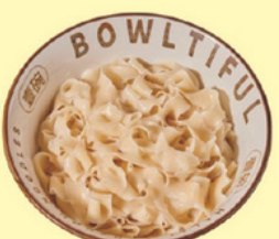
Bó Kuān 薄寬 Wide 面粗7.0mm 7.0mm Wide