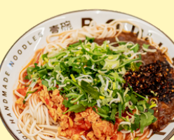
西红柿鸡蛋炸酱两合面 Dry Noodle with Stir-fried Tomato and Egg & Soybean Paste Sauce $18.80