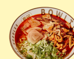
麻辣羊杂面 Hot & Spicy Lamb Offal Noodle Soup $18.80