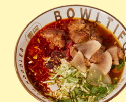
红烧牛腩汤面 Braised Beef Brisket Noodle Soup $18.80