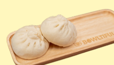
牛肉洋葱包子 2 of Beef & Onions Buns (limited supply / 限量供应) $8.8