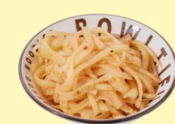
凉拌洋芋丝 Shredded Potato Salad $4.8