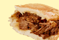
牛腩青椒夹馍 Beef & Green Pepper Burger $8.8