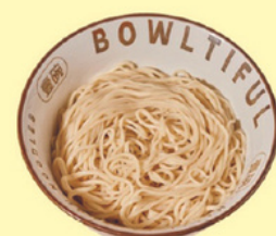
Sān Xī 三細 Thick 面粗2.0mm 2.0mm Round