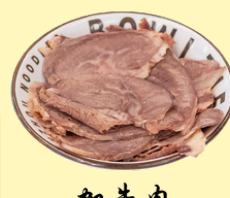
加牛肉 Stewed Beef Shank $7.8