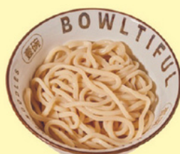
Èr Zhū Zi 二柱子 Extra Thick 面粗5.0mm 5.0mm Round