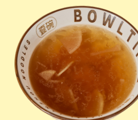
牛肉汤 Clear Beef Soup $5.0