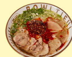
壹碗兰州牛肉面 BOWLTIFFUL Lanzhou Beef Noodle Soup $17.80