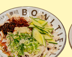
壹碗油泼面 Hot Chilli Oil Spill Dry Noodle $14.80