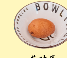
茶叶蛋 Tea Braised Egg One Whole Egg $2.5