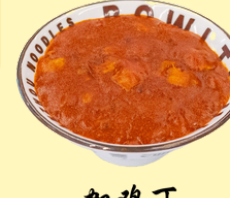
加鸡丁 Diced Chicken $8.8