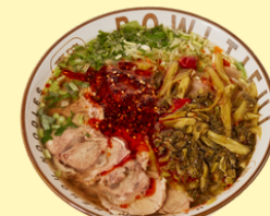
酸菜牛肉面 Lanzhou Beef Noodle Soup with Homemade Pickles $18.80