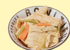
腐竹芹菜 Dried Bean Curd Sticks & Celery $4.8