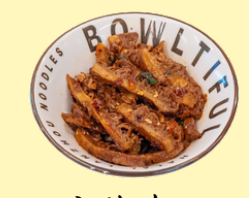
凉拌牛肚 Spicy Beef Tripe Salad 100g $8.8