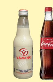
饮料 Bottled Drinks $4.8