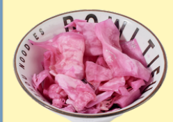
兰州泡菜 Homemade Pickles $4.8